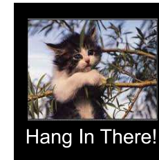
Hang In There!

Pick up the monthly news bulletin showing the upcoming events so that you can be informed on what's happening for your child. You can pick up your copy at the check in stations each month.